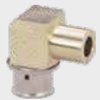
Viega PureFlow Press 90° elbow Zero Lead - Bronze - Press connection, street Model 2814.6ZL