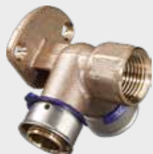
Viega PureFlow Press 90° adapter elbow Drop ear Zero Lead - Bronze - Press connections, female pipe thread Model 2825.4ZL