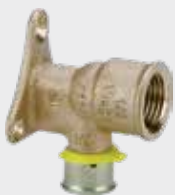
Viega PureFlow Press 90° drop ear elbow Zero Lead - Bronze - Press connection, female pipe thread Model 2825.5ZL