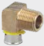
Viega PureFlow Press 90° elbow Zero Lead - Bronze - Press connection, male pipe thread Model 2814ZL