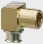
Viega PureFlow Press 90° elbow Zero Lead - Bronze - Press connection, female copper tube size Model 2814.5ZL