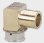
Viega PureFlow Press 90° elbow Zero Lead - Bronze - Press connection, street, female copper tube size Model 2814.7ZL Note Copper connection can be used as either male or female connection.