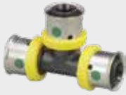
Viega PureFlow Press tee Smart Connect Technology - Polymer - Press connection Model V5618